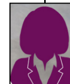
Vacant (Currently M.Harte until 30 th March)