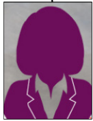
Vacant Head of Service (Leadership & Development)